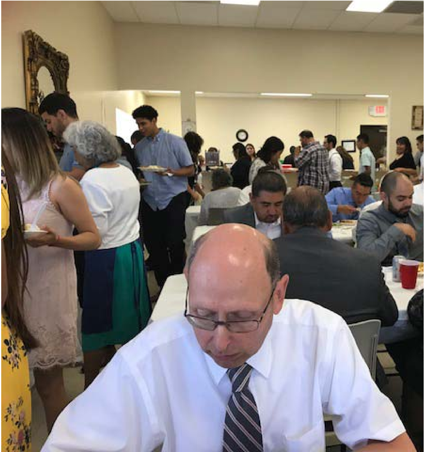
Ministers and Church members in the dining hall.