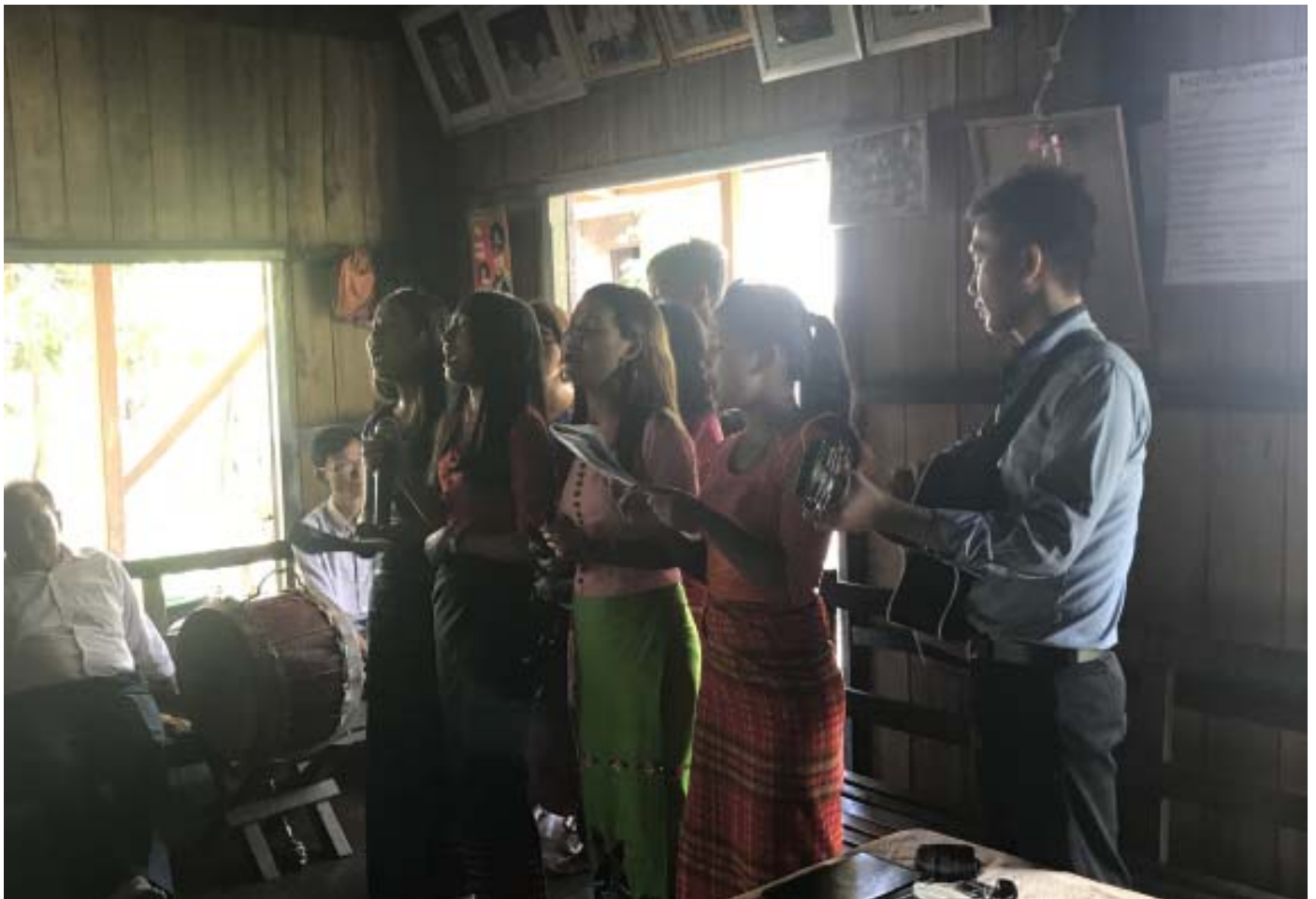
Specials being given by members of the Church in Myanmar.