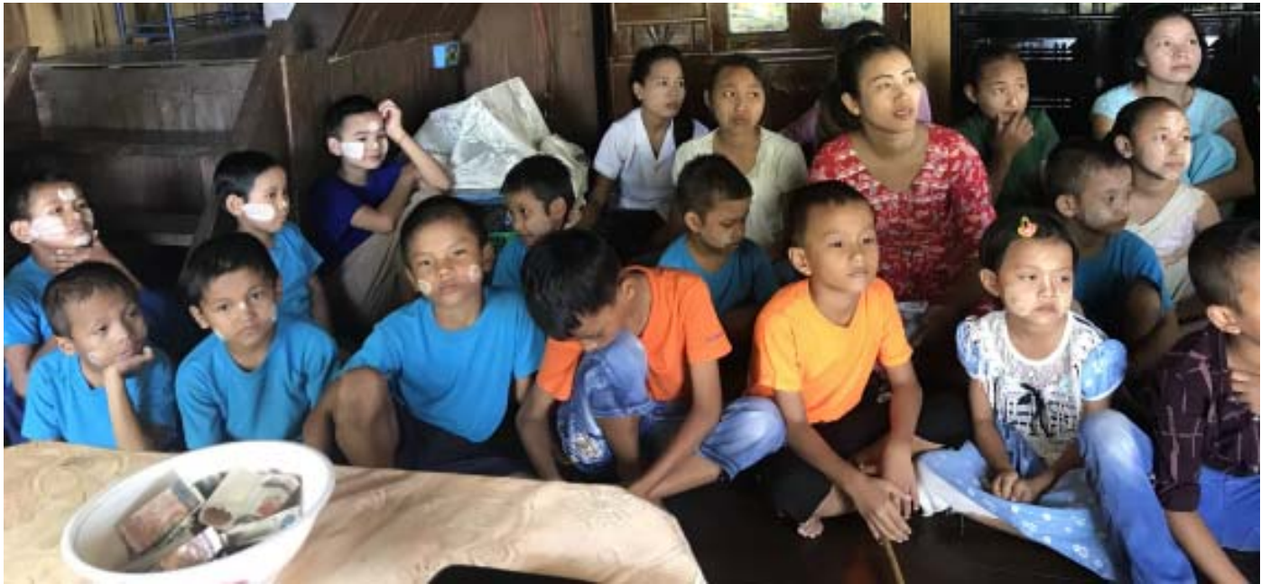
Teachers with their youth group assembled together.