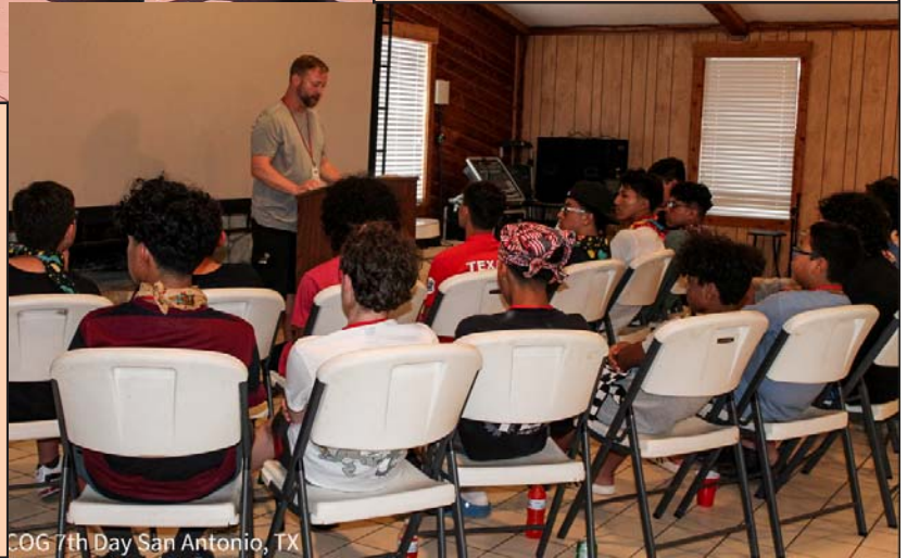
COG 7th Day San Antonio, TX

Join us for games, activities, crafts, Bible studies and other fun. The theme for this year's retreat is "Trust the Climb". Girls will be Sunday, July 23rd - Wednesday, July 26th, and, boys Wednesday, July 26th - Friday July 28th. Registration and T-shirt order deadline is June 25th. Email cog7thdaystx@gmail.com to request a registration form or with any questions. See you this summer!