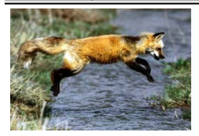
HUNTING WILD ANIMALS

Hidden away in the Bible are many animals. Some of them seem to be doing very strange things. It's hard to guess what they are from the descriptions. You will have to hunt carefully to find some of them.