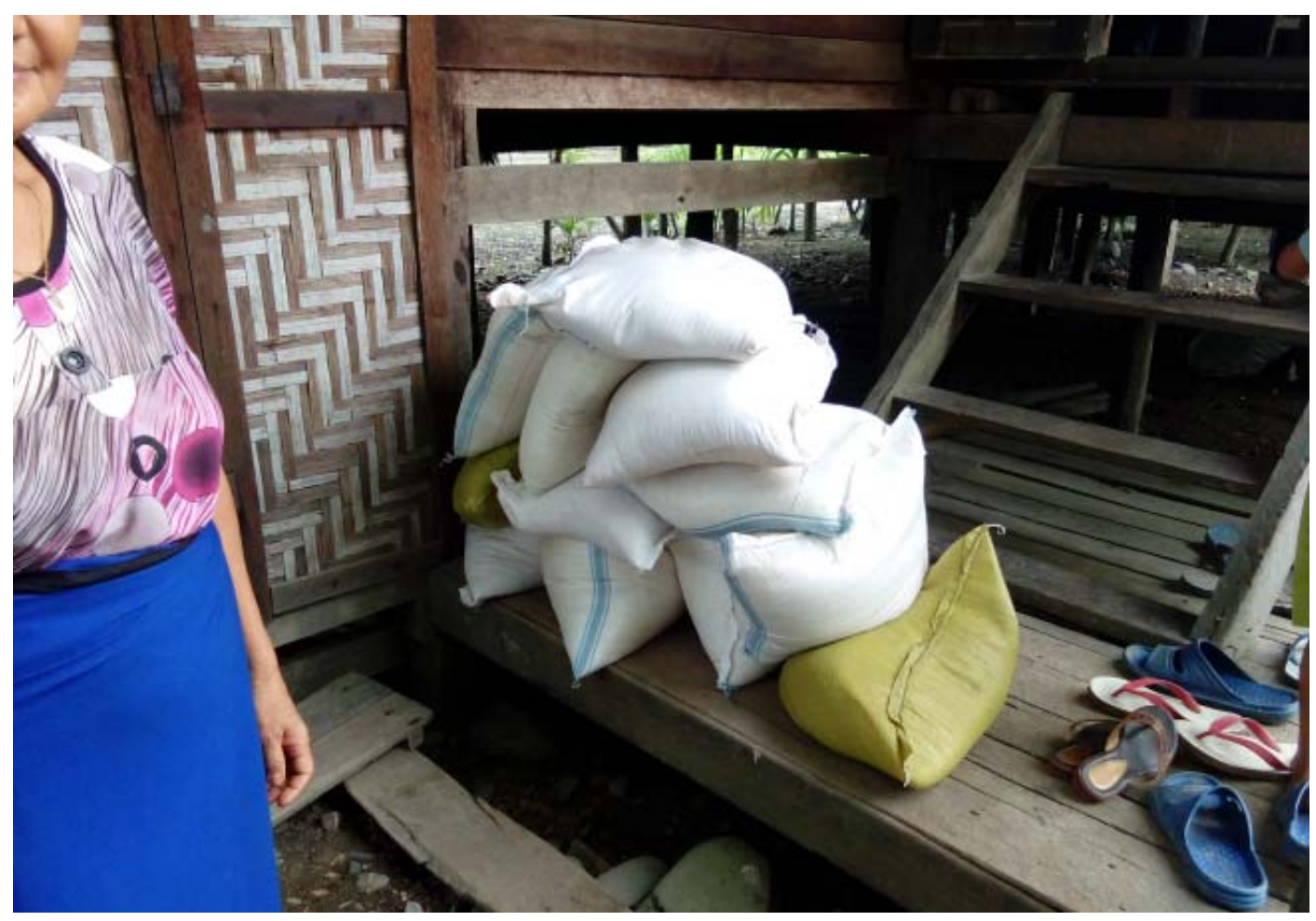
Some goods collected for the disaster relief.